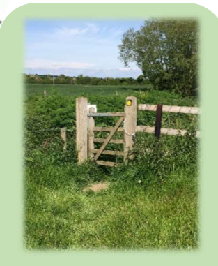
Turn left (east) and follow the river 7.4