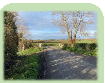
Turn left (north) on the lane towards Fivehead 7.5

©Contains Ordnance Survey Data: Crown copyright and database right 2020. All rights reserved (0100060551) 2020