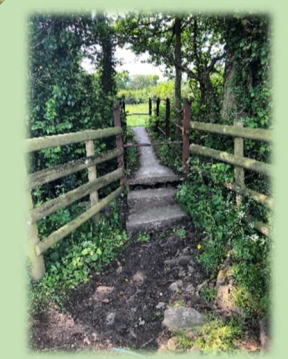
Follow the river and cross the bridge 7.3