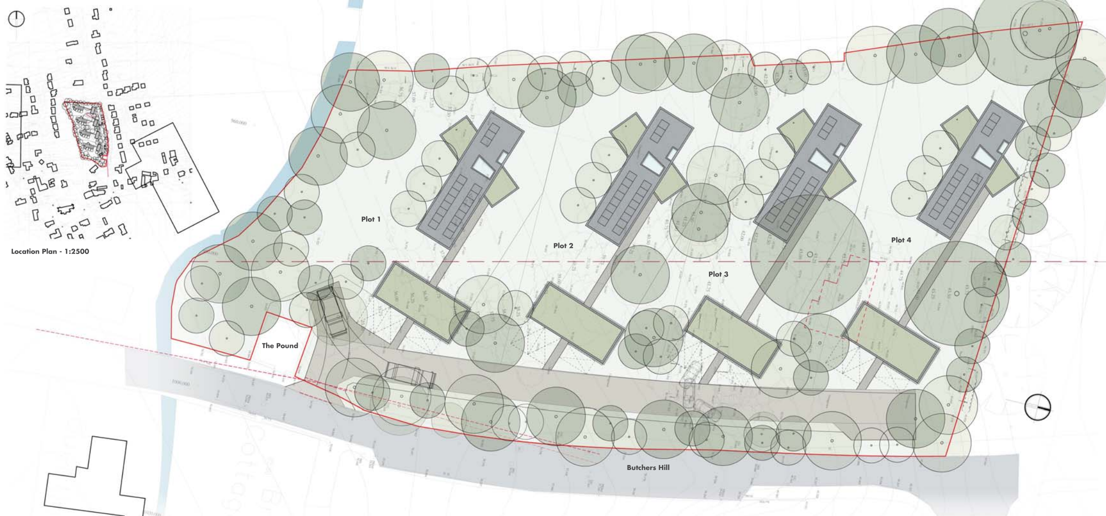
Location Plan - 1:2500